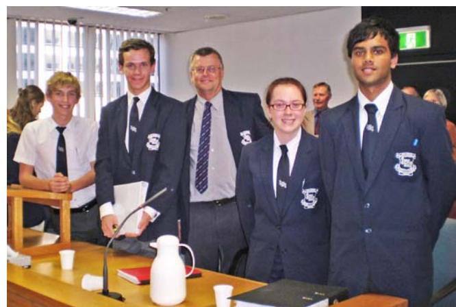
Smith's Hill Wins NSW Mooting

So what on earth is 'mooting'? Put simply, mooting involves a legal debate between two opposing teams that simulates the proceedings of an appeal court. The term originates from the activities of 14th century English judges who would congregate to debate points of law and notable cases. In the 21st century, mooting requires students (usually at a tertiary level) to undergo vigorous questioning by a panel of judges in attempting to persuade the court of their side of the case.